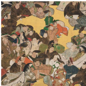
“36 Immortal Poets” Ikeda Koson