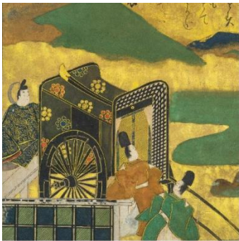
“Scene from The Tales of Ise - Nishi no Kyo” Tawaraya Sotatsu

The second chapter focuses on Ariwara-no-Narihira, who composed No. 17 'Chihayafuru~' (Unimagined / even by mighty gods / Tatsuta streams / under crimson reaches / dappling the flow) from the Hyakunin Isshu poems. The Tales of Ise, which revolves around the waka poems of the hero Narihira, is read together with paintings that evoke scenes from the tale.