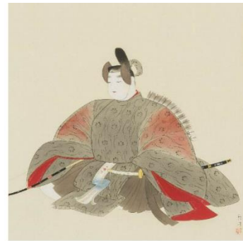
“Lieutenant General Zaigo” Kikuchi Keigetsu