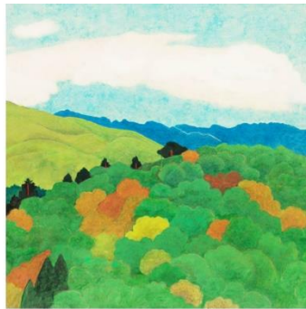
“Yamato Landscape” Ono Chikkyo