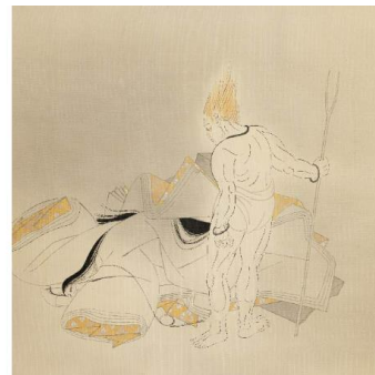
“Akutagawa” Kobayashi Kokei