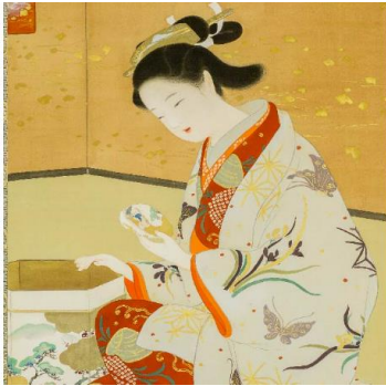
“Kai-awase no Zu”