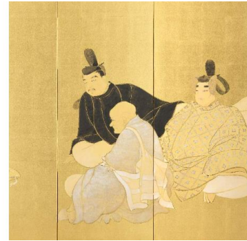
“Six Immortal Poets”