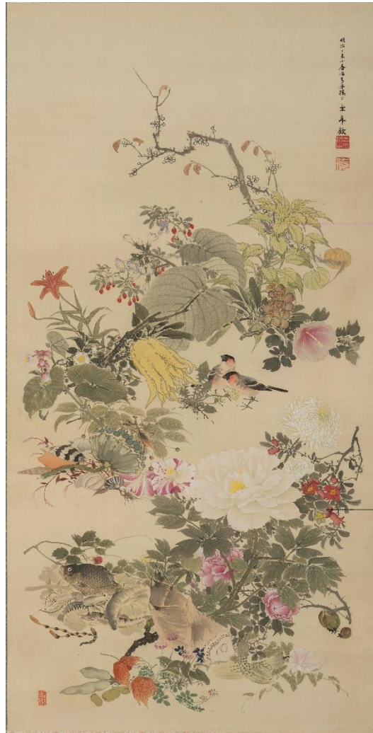
Imao Keinen "Flowers, Birds and Leftovers"