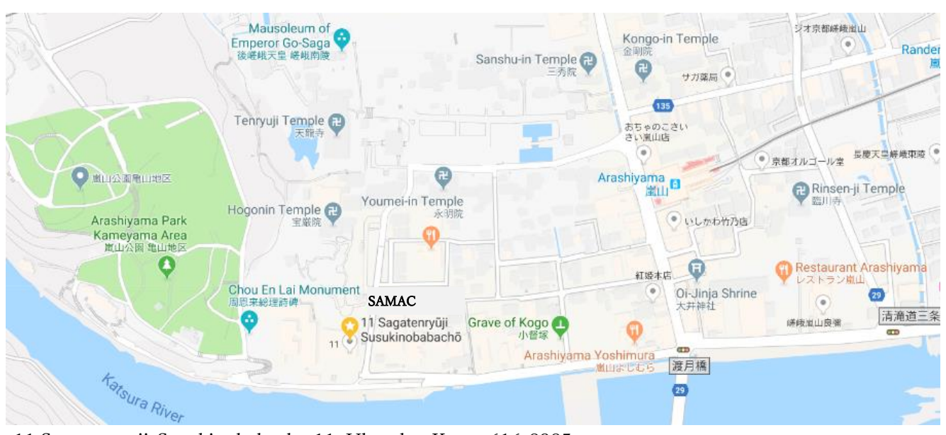
11 Sagatenryuji-Susukinobabacho 11, Ukyo-ku, Kyoto 616-8385

Nice 3 minutes walk from Togetsu bridge, next to the Luxury Collection Suiran hotel Close to Chou En Lai Monument and Hogoin Temple 5 minutes walk from Randen Arashiyama Station 15 minutes walk from JR Saga Arashiyama Station / Hankyu Arashiyama Station