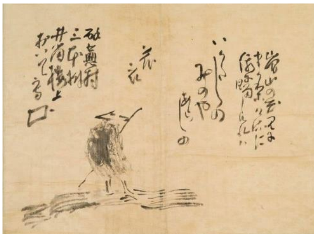
“Raftsmen” Yosa Buson