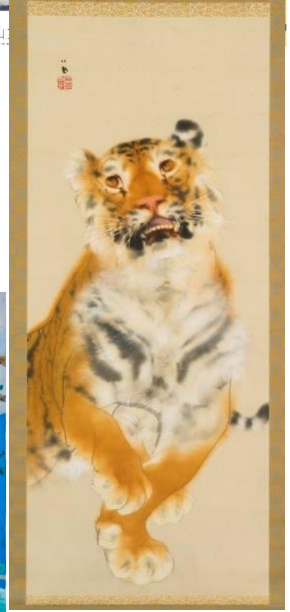
“Fierce Tiger” Takeuchi Seiho