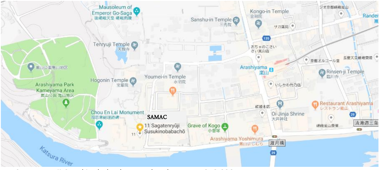
11 Sagatenryuji-Susukinobabacho 11, Ukyo-ku, Kyoto 616-8385

15 minutes walk from JR Saga Arashiyama Station / Hankyu Arashiyama Station